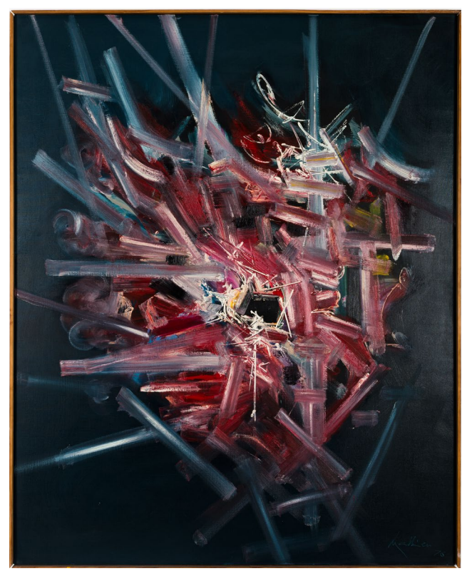
Georges Mathieu, Hommage à Goya , 1976. Oil on canvas. 162 x 130 cm | 63 3/4 x 51 3/16 in © Georges Mathieu / ADAGP, Paris & ARS, New York, 2019